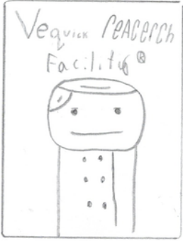
DOCTOR MUNROE OF VEQUICK RESEARCH FACILITY IN CONCORDOR COUNTY OF RAVENCLAW