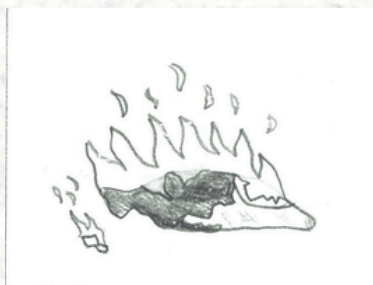
Far left: an artists depiction of the battle sence